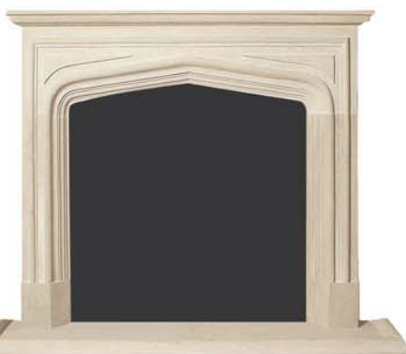
Typical Elizabethan Style

Choose from our famously large range of stone.