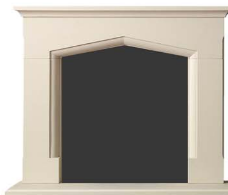
Typical Tudor Style