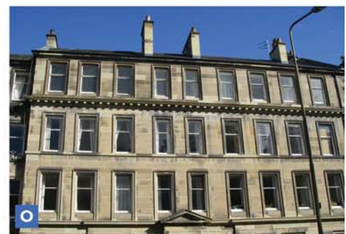
A McEwan Hall - Edinburgh - Witton Fell Sandstone