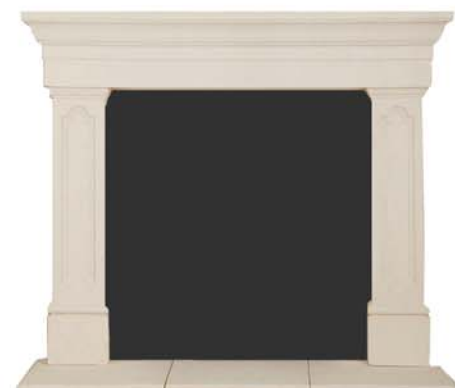
Typical Edwardian Style