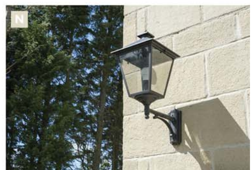
A Strathaven New Build - Strathaven - Buff mix walling with Swinton surrounds